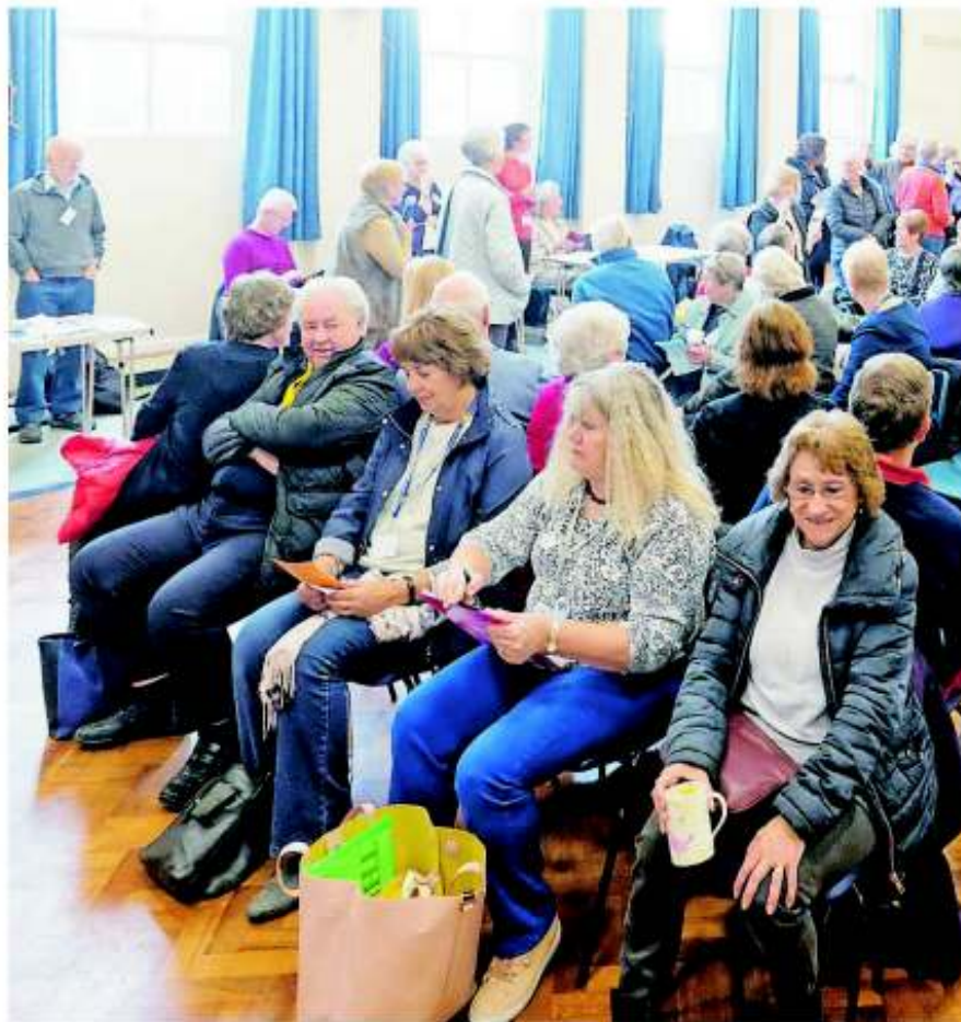
One of the U3A gathering before the pandemic in 2019.