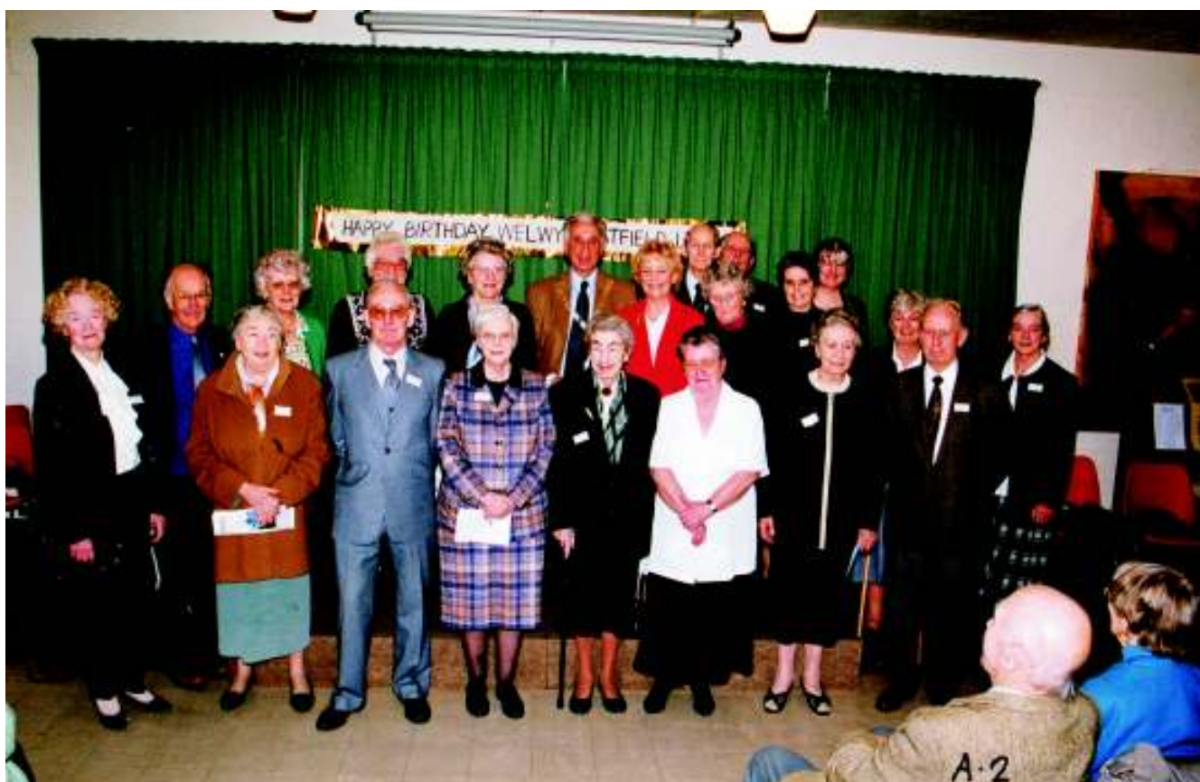
15th anniversary party, 2002: the Mayor with founder members